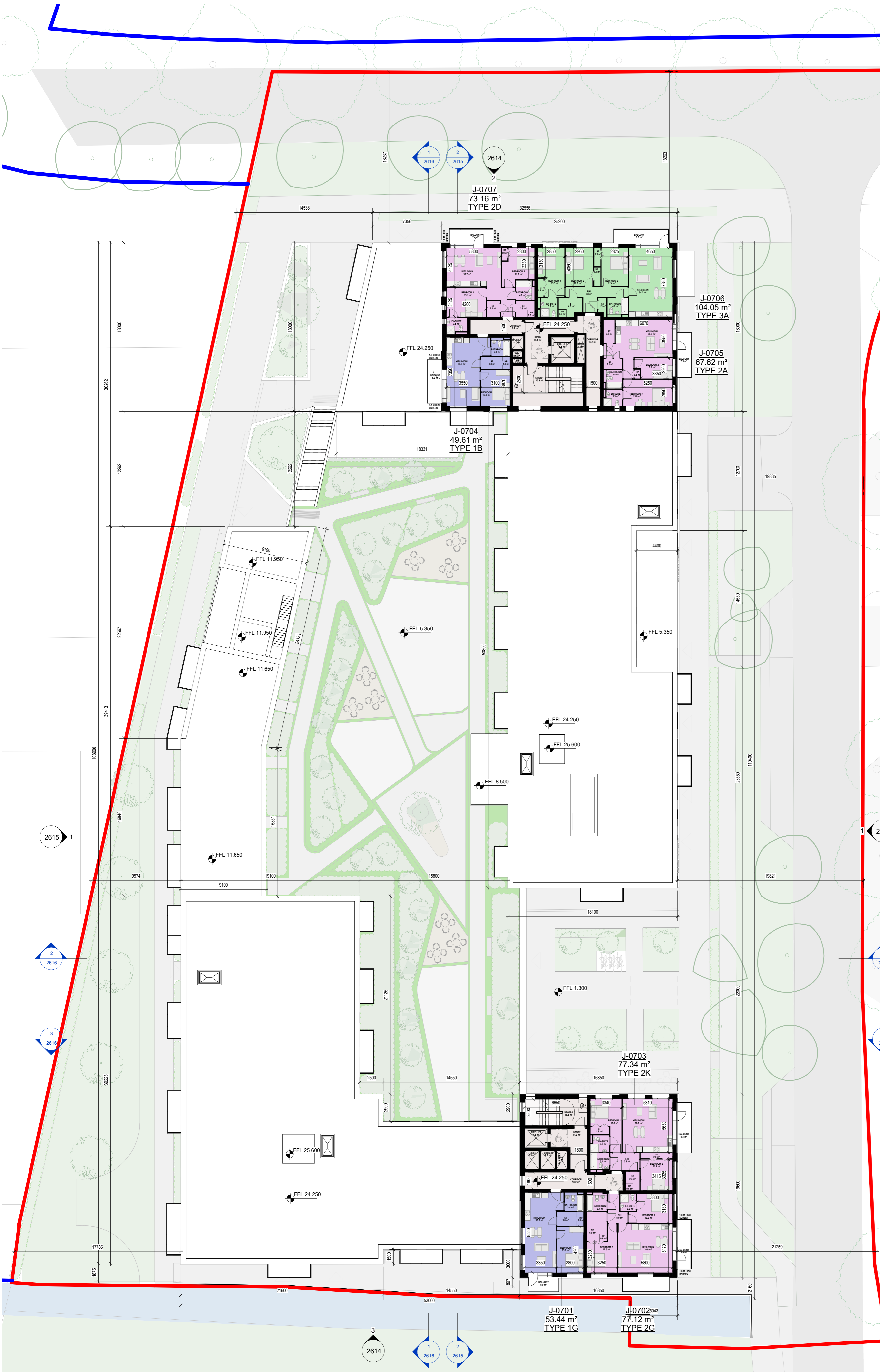
1 PLAN - BLOCK J - LEVEL 07 1 : 200

Please consider the environment before printing this sheet